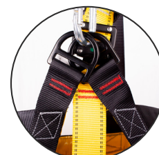
Three D rings (metal) for anchor connection