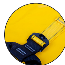
High visibility colouring