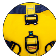
Fast fit buckles for rapid ingress/egress