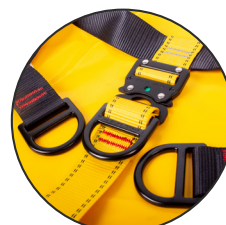
Colour coded stitch patterns and webbing