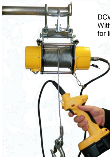
DCW-250 With hook for lifting