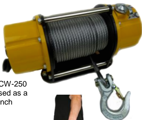
DCW-250 Used as a winch